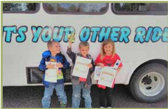
Incorporate all ages into your activities!

Agencies are also requested to send their list of events and activities to Tara Grell, the new graphic designer for the University of Nebraska - Omaha. The deadline to submit your activities is March 19, but Tara will also add late submissions to the website. The list of activities will help staff determine which events they can attend.