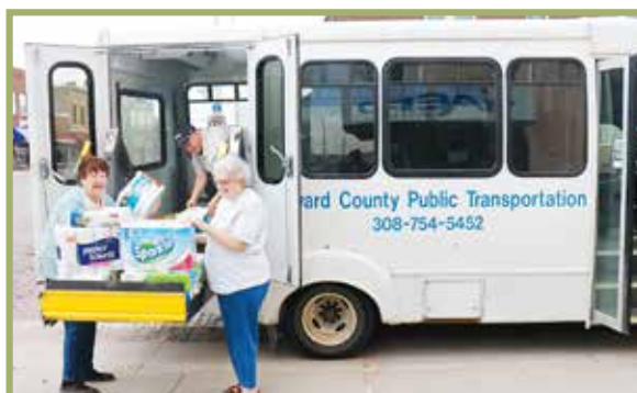
Bring your community together for a great cause!