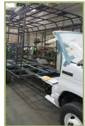
Photo on right: Welded steel bus frame ready for fiberglass body assembly.

When inspecting NDOT buses on the assembly line, Wayne identified some issues with the vehicle specifications which were corrected prior to final assembly.