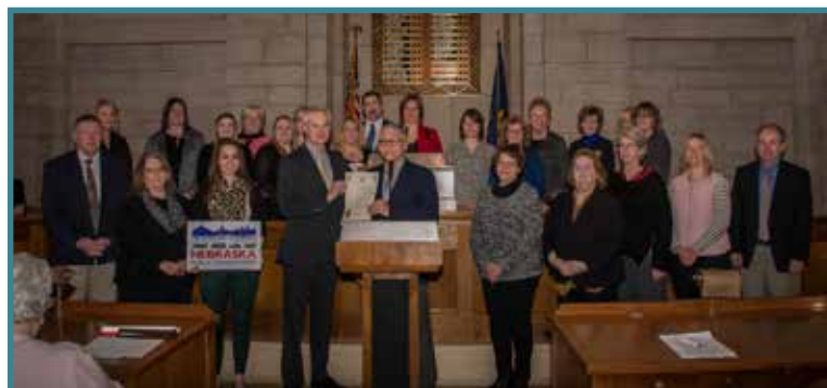
Lt. Governor Foley presents a proclamation for Public Transit Week.

The event then featured training and updates at the Courtyard by Marriott in downtown Lincoln.