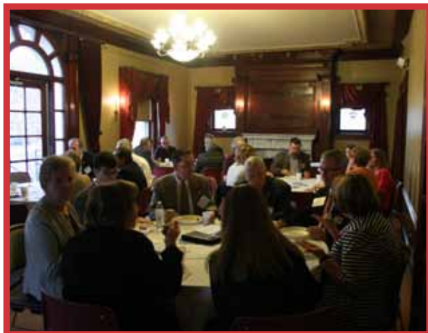
Visit with Senators during the breakfast.

Attendees are then invited to celebrate NATP's 35th Anniversary at Lazlo's restaurant in the Haymarket. Meal and cake will be provided free of charge for members. Guests can also attend for a fee. Please RSVP to the office if you plan to attend the dinner and haven't already registered.