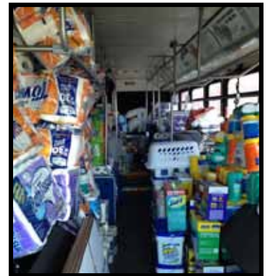
StarTran stuffed numerous buses of charitable donations in 2015

On Saturday, April 16th, we also operate our Big Red Express for the UNL Red/White Spring Game from two lots – North Star High School and SouthPointe Pavilions, to and from the game.