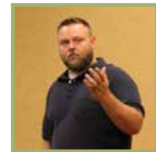
TSI Garrison provided information on developing safety plans.

safety scenarios including an active shooter at the workplace or on a bus. TSI Garrison is willing to work with transit systems to develop security plans. NDOT is working with Garrison to develop plans. Security packets and other information are available at the NATP office. If you were unable to attend and would like a packet, please contact the NATP office.