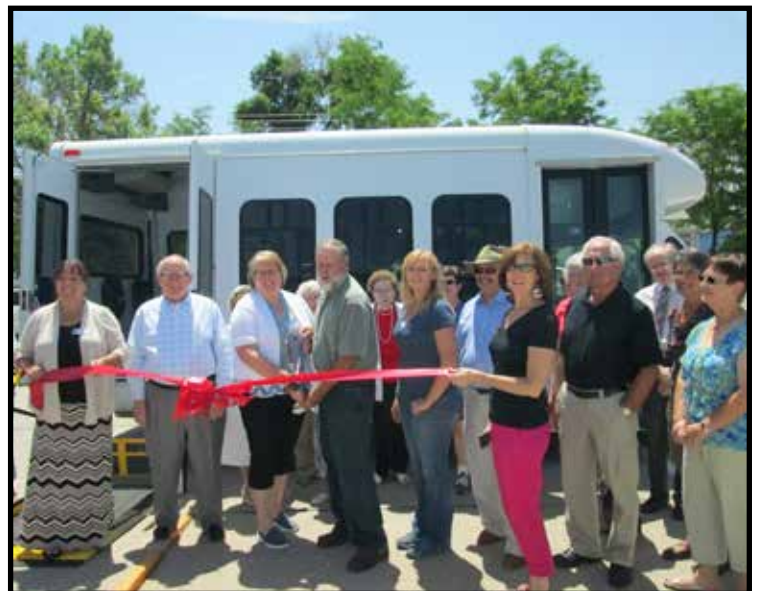
A ribbon-cutting ceremony was held in July 2015.

They embrace the fact that the City of Alliance offers such a beneficial transportation system. I would describe our riders as "thankful." This service provides a great way for people to get rides to places and maintain their independent living. We are extremely lucky to have public transportation available in Alliance!