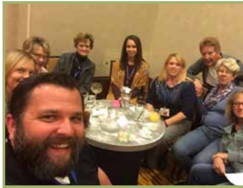
A group of Nebraska managers gather for a photo opportunity.

These stories resonate the importance of transit, especially where you have rural residents who are economically disadvantaged, physically handicapped, and/or isolated.