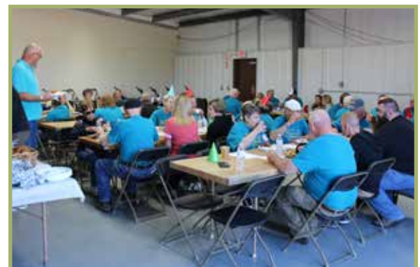
The Rodeo concluded with an awards banquet at the Nebraska Safety Center.