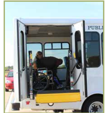
A Rodeo participant completes the wheelchair securement segment of the Rodeo.

Save the date for next year's training and Rodeo: September 18-20, 2018.