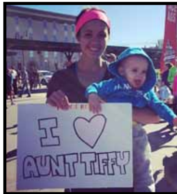
My nephew cheered me on during the race.

I had quite a few steps after finishing my first (and quite possibly last) half marathon last month. It was a great way to ruin a beautiful day! I'm only half joking. I completed the race 30 minutes faster than I thought I would. I consider that a success!