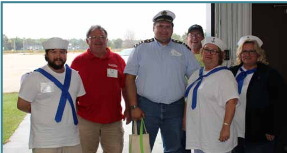
The staff from Hall County Public Transportation took home the Spirit Award.