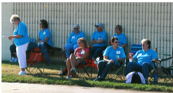
Drivers competing at the Rodeo awaiting their turn to drive!