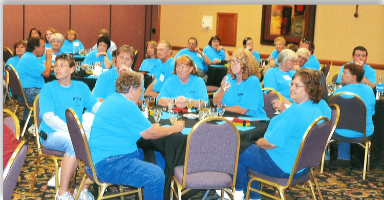
Drivers and Managers (judges) were awaiting the NATP Rodeo results at the Awards Banquet.

October 24-28 19th National Conference on Rural & Intercity Bus Transportation Conference Burlington, Vermont December 8-10 NACO Conference , Lincoln December 9 NE Public Transportation Coalition Meeting 10 am - 3 pm January 26 Legislative Day , Lincoln Meet at the Capitol for Dutch Lunch February 2 Snow Day for Legislative Day April NATP Drivers Training 6 sites across Nebraska Dates to be announced: The sites will be the Gering Civic Center, Ogallala City Offices, Kearney, NE Safety Center, Norfolk Senior Center, Grand Island Senior Center, Beatrice ESU May 22-27 CTAA National Rodeo/Expo Indianapolis, Indiana June 14-16 NATP Managers' Workshop Fairfield Inn & Suites, Grand Island September 20 & 21 NATP Drivers' Training and Statewide Rodeo