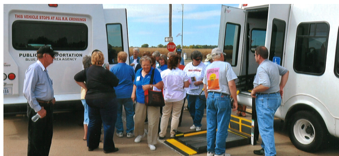
The NATP Drivers Training PM session was held at the NE Safety Center. Lift questions, securements training, and driver techniques were on tap for the beautiful fall day.