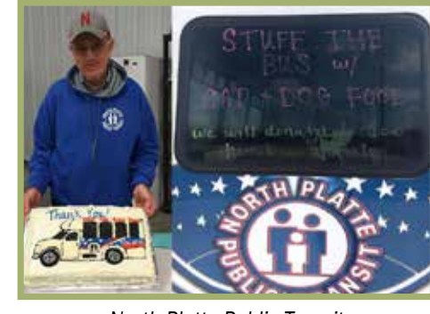
North Platte Public Transit