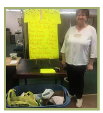
MAAA - St. Paul