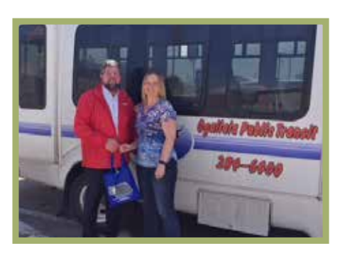
Ogallala Public Transit