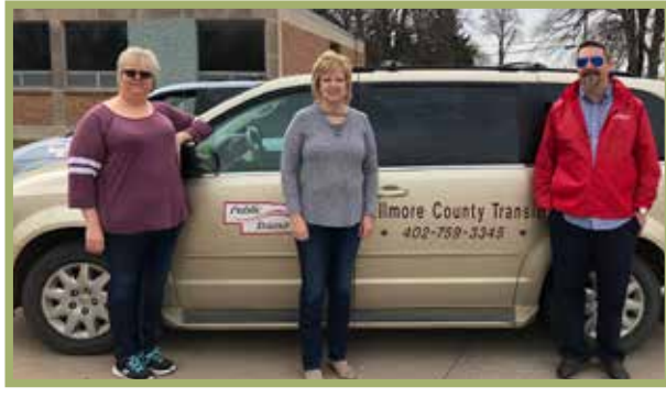
Fillmore County Rural Transit Service