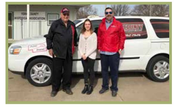
York County Public Transit