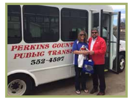
Perkins County Public Transit