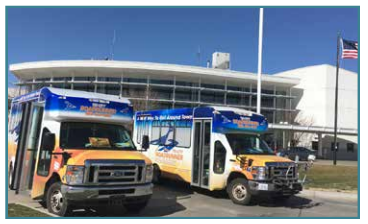
Tri-City Roadrunner serving West Medical Center

The Elected Official Award was for the outstanding support and commitment to planning and collaboration in the development of the Tri-City Roadrunner, the new flexible route transit service, which began operation on January 10, 2018. The transit service operates in the cities of Scottsbluff, Gering, and Terrytown. Over two years of planning and