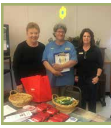
Central City Public Transit