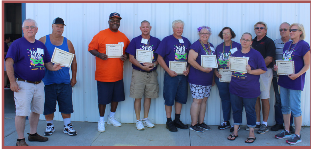
Drivers competing in the Mini Van Division