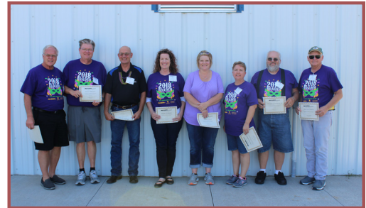
Drivers competing in the Small Bus Division

Following the Rodeo competition, all attendees gathered for an awards luncheon. Drivers from both divisions were introduced and presented with certificates for their participation.