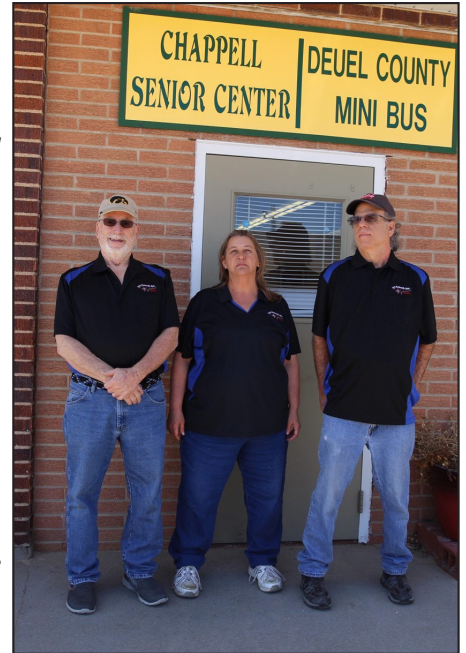
Deuel County staff

It wasn't until NDOT held mobility management meetings that Kimball County began to realize the potential services that could be provided in our area. It simply started by providing our county residents a way to reach specialized medical needs that could only be found outside of our county. One conversation lead to another and today we provide service in 3 counties - Banner, Kimball, and Cheyenne, with 4 vehicles. We are contracted to take on Deuel County July 1st, allowing us to serve all of the Sothern Panhandle of Nebraska.