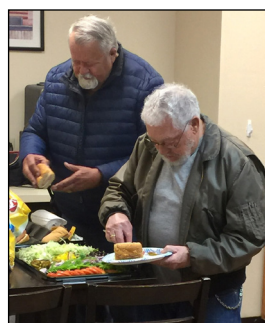
Chadron Public Transportation staff