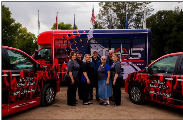
Kimball County staff

I consider myself a new manager with only two years of service in public transportation. I am constantly in a state of learning. My experience is mostly in residential business management with a unique perspective from running a transitional housing project using 17 different funding sources.