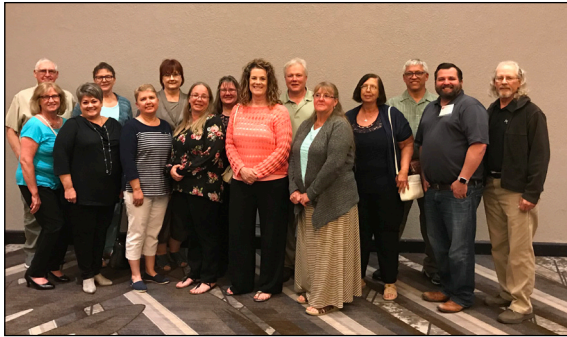
Group photo from the CTAA Rodeo Awards Banquet.