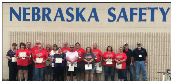
Drivers in the Minivan Division