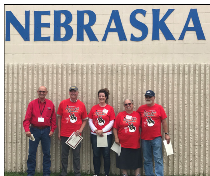
Drivers in the Small Bus Division