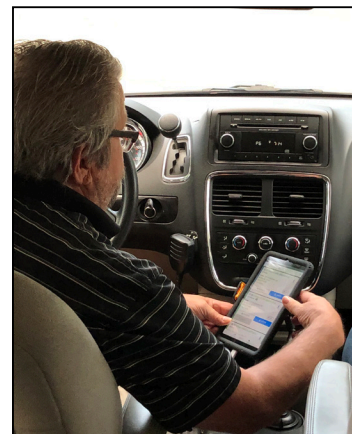
Norfolk Public Transit